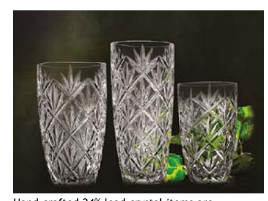
Hand-crafted 24% lead crystal items are manufactured