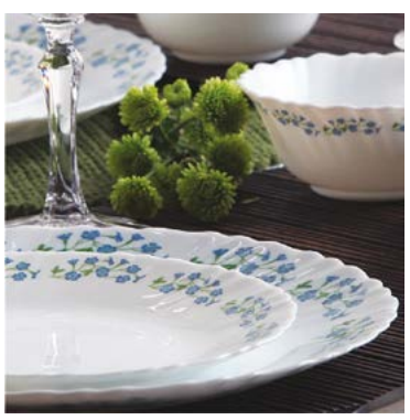
A diverse range of opal and lead crystal tableware is produced by La Opala.

His daughter-in-law also works for the company, co-ordinating La Opala's important product design and advertising initiatives. The glassmaker introduces 20-30 new products every year. This high turnover is considered necessary because consumers are constantly looking for something different. The company's distinctive brands are La Opala opalware, Solitaire