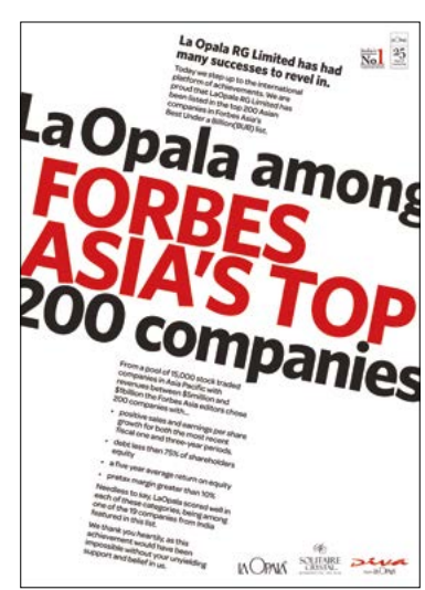
La Opala features in the Forbes list of Asia's 200 best companies with sales under $1 billion.

The impact of a multi-brand marketing strategy is said to have placed La Opala at the forefront of Indian glassmakers in terms of turnover according to latest industry statistics. With customers throughout the world,